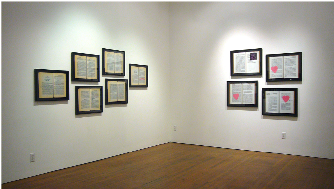
Marginalia , Installation view Artspeak