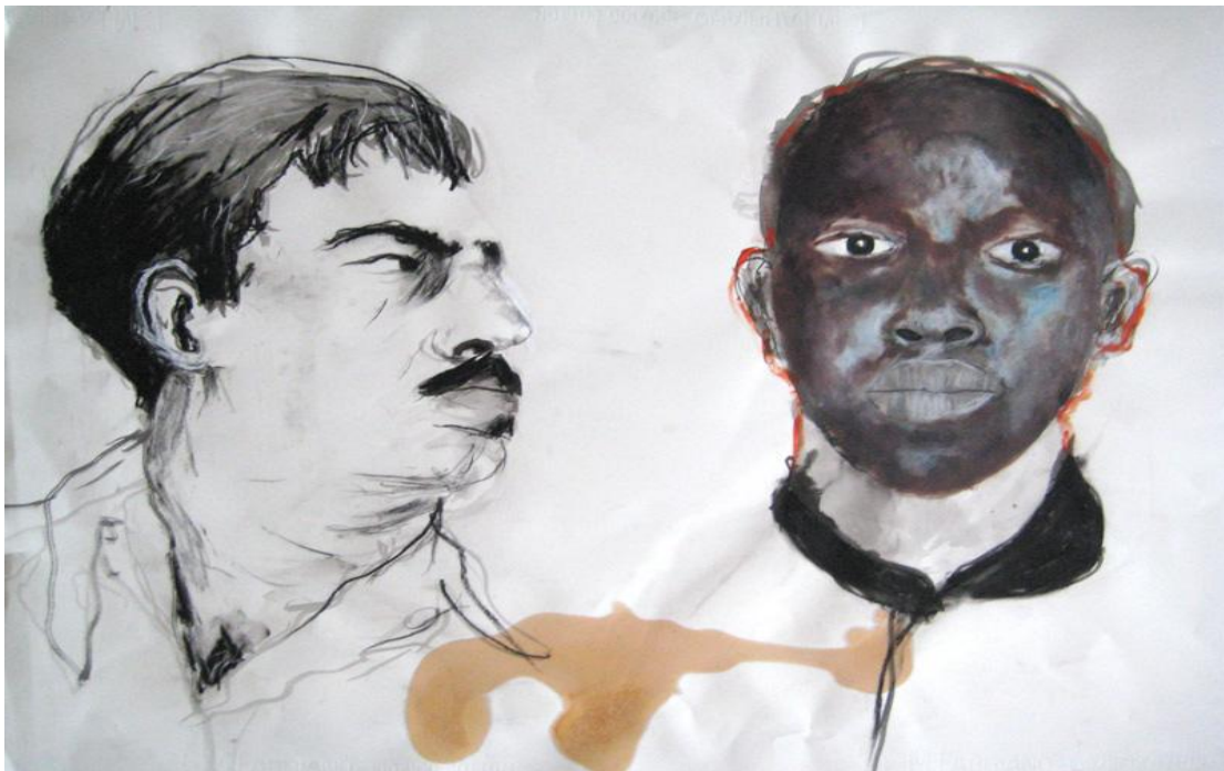
Maya Pindyck, Face to Face , 2004 Mixed media on paper

Maya: Oh, "stop"— (M. Pindyck, personal communication, November 5, 2009)