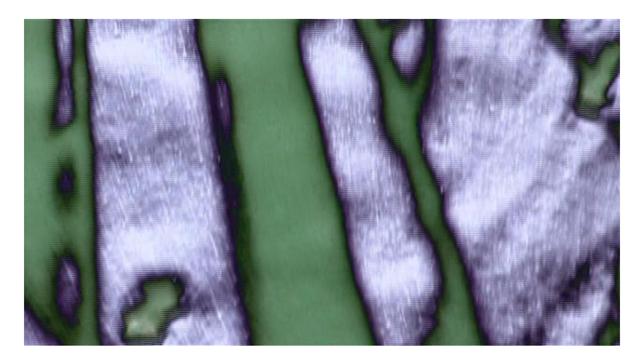
Image 2a. Extreme close up of the tire swing. Without , 2007. Screen shot. Future Perfect Project, Free Street Theatre. Chicago, IL.

Encounter One : I sit in front of my laptop, earphones in place in order to not wake my sleeping baby as I watch the youth-produced film Without (2007) by Free Street Theatre, Chicago. I hear a young woman's voice-over and watch as the camera travels in extreme close up along a series of abstract, blurred shapes and textures in shades of purple, black and slate blue.