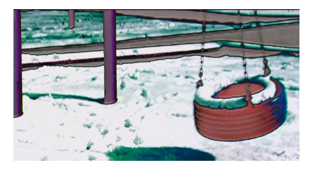
Image 2b. Tire swing. Without , 2007. Screen shot. Future Perfect Project, Free Street Theatre. Chicago, IL.