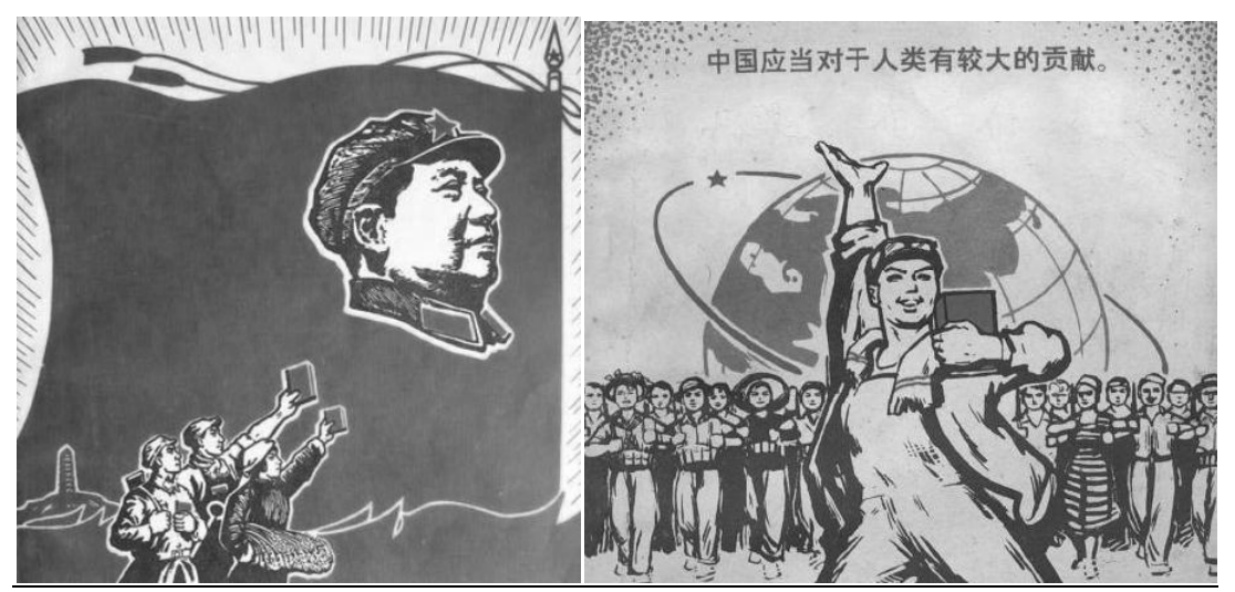
Figure 5 & 6. Illustrations of workers in one Chinese textbook (Middle School Textbook Writing Committee of Beijing, 1967, pp. 1–2).

Numerical representations, along with verbal and pictorial representations were another way of integrating the ideologies of the time into Chinese mathematics textbooks. In the books selected to examine, we located data from the Korean and Vietnam wars that were used as one resource representing the ideological content (see Figures 7 & 8). For example, in figure 7, the question asks students using addition to find the answer that how many enemy troops were killed in the Korea War. In the numerical ideological representations, numbers were used as mass media to point out how brave the people of socialist countries were as well as how cowardly the people of opposite ideologies were.